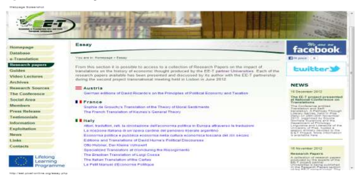
Figure 4: Research Paper Section of the EE-T Portal